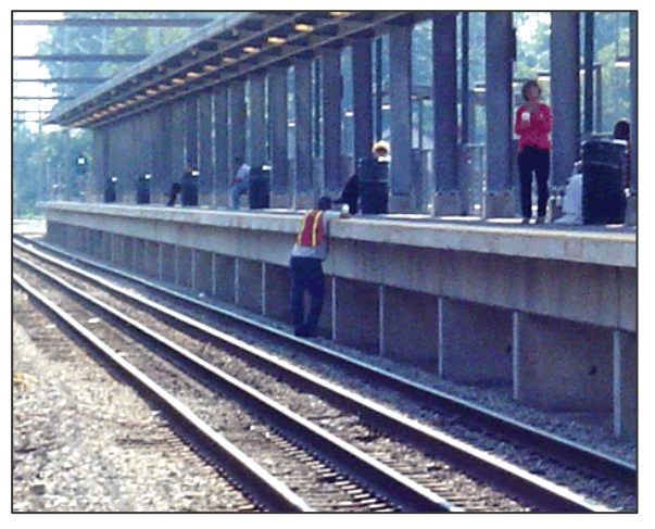
FRA Continues to Promote Safe Workplace Practices

Since the implementation of the Roadway Worker Protection (RWP) regulation in 1997, the railroad industry has had 34 roadway worker fatalities. FRA and the industry took additional notice following nine roadway workers fatalities between mid-2006 and late 2007. During this period, the frequency of roadway worker fatalities was at its highest level since the regulation went into effect. FRA reached out and contacted roadway workers with the hope of bringing additional awareness and safety to the workplace. Three more fatalities have occurred since then. FRA wishes to revisit some guidance during this effort to promote awareness.